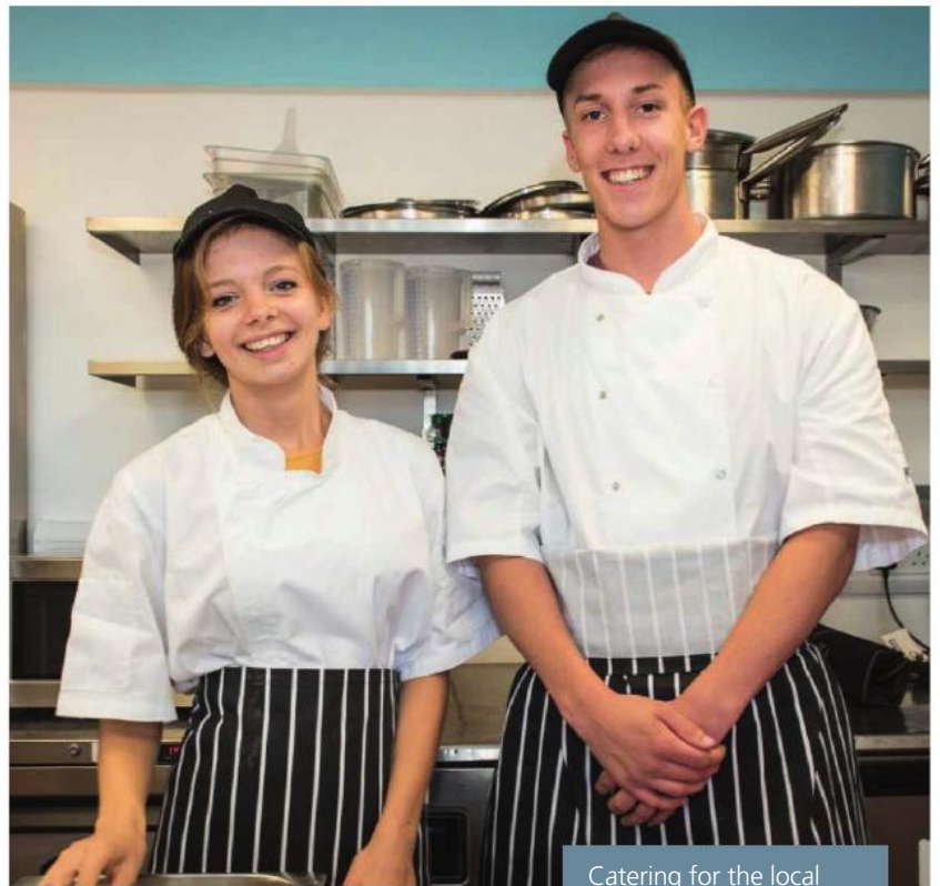
Catering for the local community develops work-relevant skills

In our early days as a charity, we were grateful for the generous support of volunteers. Twelve years later we still value the contributions our volunteers make. The wider community wants to be a part of something that is changing their town for the better. Several local churches in particular